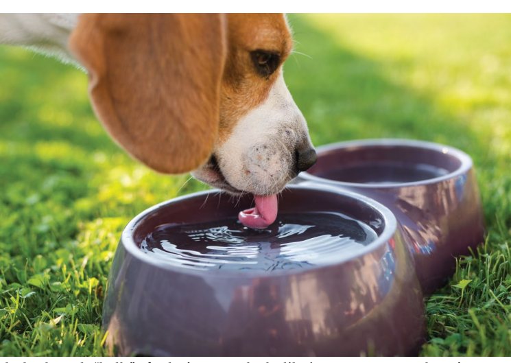
The backwards "ladle" of a dog's tongue looks like it scoops water. It doesn't.

It wasn't sloppy dogs that first caught scientists' eye — it was clean, posh cats. In 2010, researchers from MIT, Virginia Tech, and Princeton