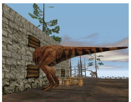
In one strange glitch in Trespasser, dinosaurs became stuck in walls.

This bug stemmed from a mestep — the time inter-