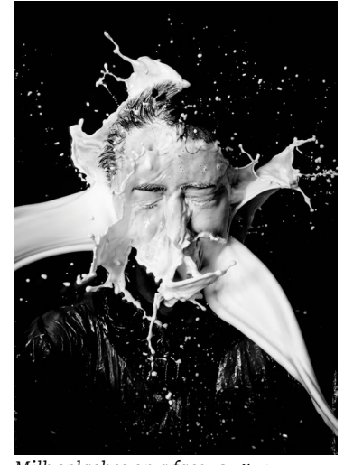
Milk splashes on a face.