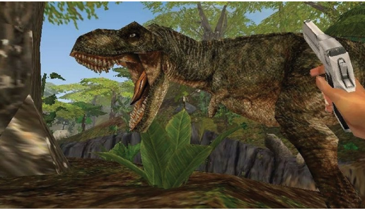
Trespasser was the first video game to use a fully-fledged "physics engine" in its software. It didn't go quite to plan.

Trespasser flopped. "Trespasser was a victim of its own greatness," says Berrier. "They discovered something way ahead of its time."