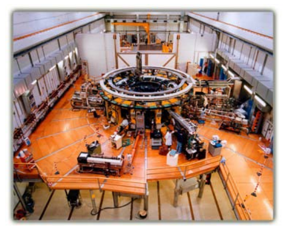
The RFX-mod Experiment

To confirm their relevance for thermonuclear fusion, RFX helical plasmas should be further