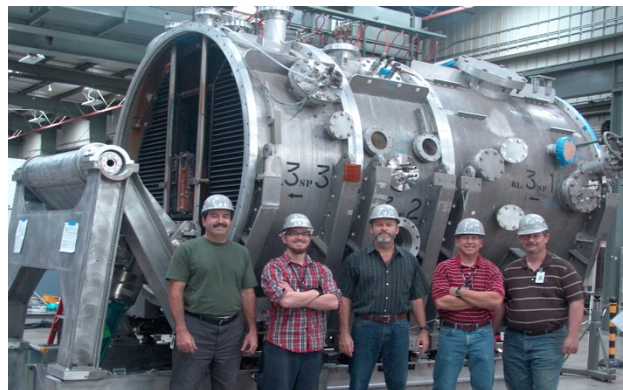
Figure 1. Massive Beam, Precise Control: Members of the DIII-D Neutral Beam Group in front of a beam housing for two of the eight beamlines.

Energy and momentum in DIII-D's magnetically contained plasma is delivered by large neutral-particle beams systems, and GA's recent demonstration of precise control of injected power and torque is a first. Scientists are now able to pre-program these inputs over the duration of plasma discharges (called "shots"). GA led the development effort in collaboration with scientists from the University of California-Irvine and Princeton Plasma Physics Laboratory.