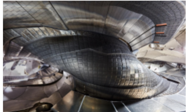
Figure SEQ Figure \* ARABIC 1:(Left) Wendelstein 7-X viewed from the outside. Visible is a section of the donut shaped vessel which houses the superconducting magnetic field coils. (Right) Wide angle view of the interior of the Wendelstein 7-X plasma vessel, showing the different armour materials designed to take up the heat from the plasma. The surface contour of the wall follows the shape of the plasma. On average, the radius of the plasma is 55 cm.

“The advantage of stellarators over other types of fusion machines is that the plasmas produced are extremely stable and very high densities are possible”, said Dr. Novimir Pablant, a U.S. physicist from the Princeton Plasma Physics Laboratory, who works alongside a multinational team of scientists and engineers from Europe, Australia, Japan, and the United States (the U.S. collaboration is funded by the Department of Energy).