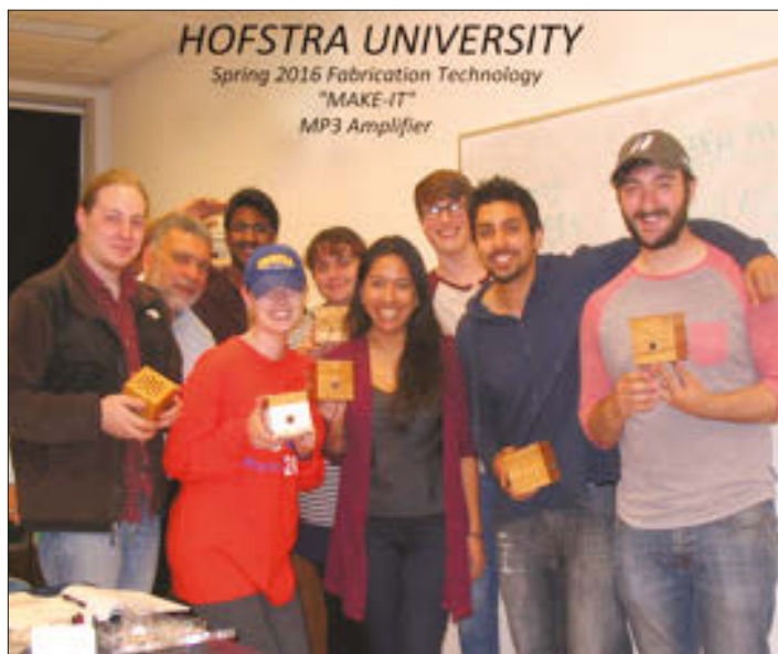
Make-it class with mp3 amplifiers

Materials for these courses cost approximately $100 per student. A basic machine shop can be equipped for under $10,000, but much can be accomplished with hand tools. Details and syllabi can be obtained from the corresponding author, SC.