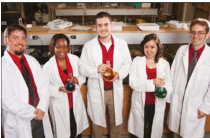
First Cohort of Noyce Scholars-Awarded in Fall 2012

The program has awarded 29 scholarships to physics/chemistry majors/minors and 37 internships to freshman/sophomore NSM