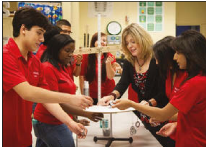
Cohort Building through the Science By Inquiry Course

majors. To date, seventeen Noyce Scholars have graduated and are teaching or have received teaching positions in high need school districts; 100% completed their degrees within 6 years with a 4.5-year average. Ten graduates are certified to teach physics – as compared with the previous decade where UH had not graduated any students certified to teach physics. Twelve Noyce Scholars are still in the teachHOUSTON program, and thirty-seven interns served as camp counselors in the EMBHSSC. All but three interns are still enrolled in the teachHOUSTON program, and five interns have received Noyce scholarships. Overall, the combined retention rate to the teachHOUSTON program of the Noyce Scholars and interns is 94% (62/66). Incorporation of the Science By Inquiry course has led to 12 students pursuing the Science Composite Certificate, strengthened the physics content knowledge for students not majoring/minoring in physics, and built a learning community. Due to the course’s success, a similar course was created for preservice middle school teachers and has been offered for the past two years. Additionally, a Biochemistry By Inquiry course is being developed for better preparation of teachHOUSTON students’ pedagogical content knowledge in biology and chemistry.