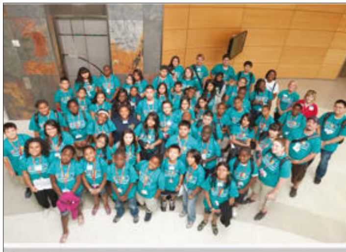
ExxonMobil Bernard Harris Summer Science Campers and Noyce Interns

The UH Noyce program is a collaborative effort of the College of Natural Sciences and Mathematics (NSM); the teachHOUSTON (tH) program, a teacher certification program for NSM majors; the College of Education; and local school districts. Junior and senior level physics/chemistry majors/minors and post-baccalaureate students can apply for the $12,000/year Noyce scholarship. Following graduation, students who accept the scholarship are required to complete two years of service in a high-need school district for each year of scholarship support they received. In ad-