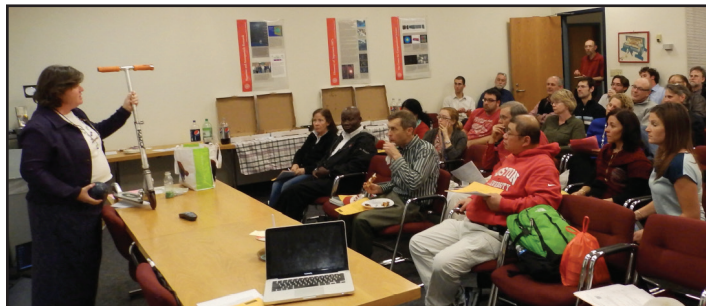
BU Physics Teacher Network meeting in October where teachers, BU undergrads, grad students and PhysTEC faculty share ideas, best practices and experiences in urban schools.

teaching, as well as members of the PhysTEC team.