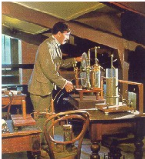
Historical reconstruction of the Master at work (display in the Rutherford Den prior to its replacement).