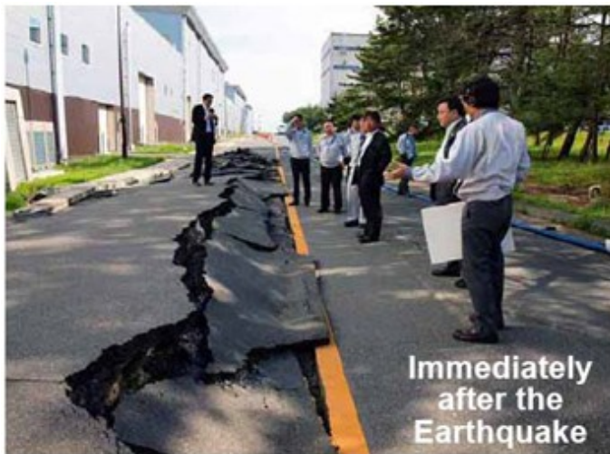
Photo 1: Liquefaction occurred at several locations in JPARC's Tokai campus.