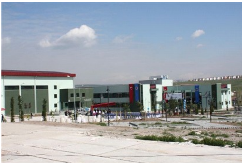
The opening ceremony of the first buildings of the Accelerator Technologies Institute, and the IR-FEL building, May 9, 2011, Gölbaşı, Ankara, Turkey.

Parallel to the TAC project, Turkey is a signatory member of SESAME, the synchrotron project located in Amman, Jordan, together with six other countries in the region. Furthermore, Turkey has a candidate status to be a full member of CERN within the next 4 years, a process approved and started in 2010.