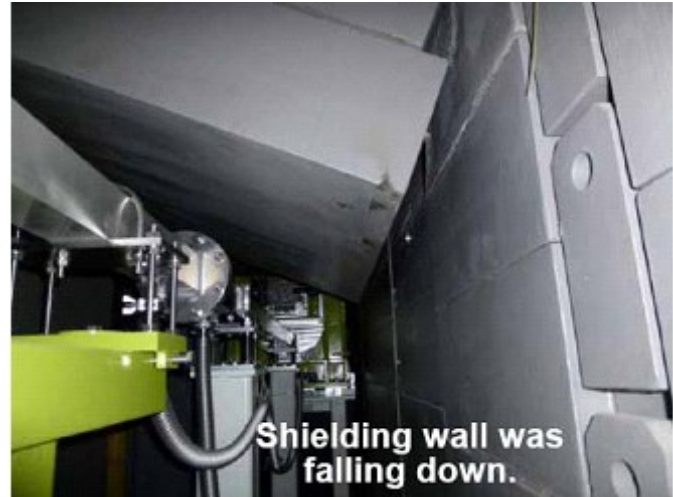
Photo 2: Radiation shields fell down at multiple locations in the accelerator complex of JPARC.

The campus has two accelerator complexes, the B-factory (an electron-positron collider) and the Photon Factory (a synchrotron radiation facility), and various R/D accelerators. An 8 GeV electron linear accelerator serves both accelerator complexes. Photo 4 shows some of the damage to the 8 GeV linear accelerator. The B-factory has been undergoing a long-term upgrade and its collider ring had been decommissioned