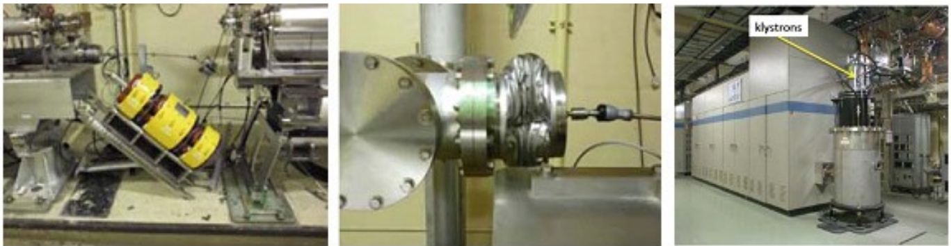
Photo 4: Damage to the 8GeV linear accelerator at KEK Tsukuba: A quadrupole magnet fell off the support structure (left); vacuum leak developed at bellows (center); two klystrons were damaged due to vacuum leak (right).