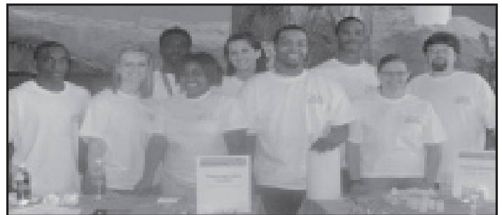
Nanodays at the Children's Hands On Museum

The grant helped facilitate purchasing the much needed materials to be able to do the outreach and provide supplies to the students of the classroom we work with, as well as creating an inventory for the ongoing project with the Children's Hands on Museum. They are very appreciative of the time we give through the program as well as the extra activities the students are allowed to engage in.