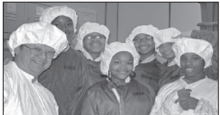
"Gowning up" for a tour of the MINT Center Clean Room